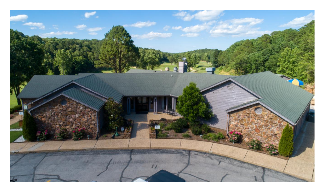
PLEASE REFER TO STANDING RULES , "CLUBHOUSE RULES" PAGES 7-8; "FACILITY USAGE" PAGE 13 ANG "GROUP USAGE", PAGE 21

See also: Club House Rental for private parties or receptions.