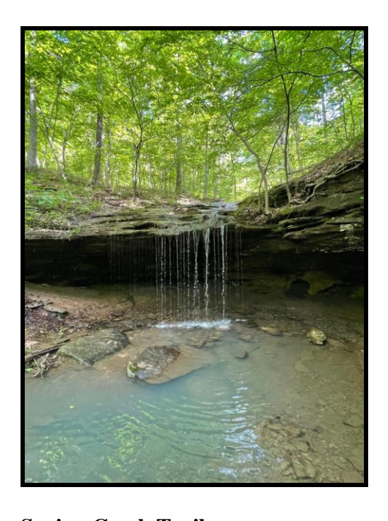
Spring Creek Trail

See also information on the Conservation Easement., Welcome Packet, Page: 10