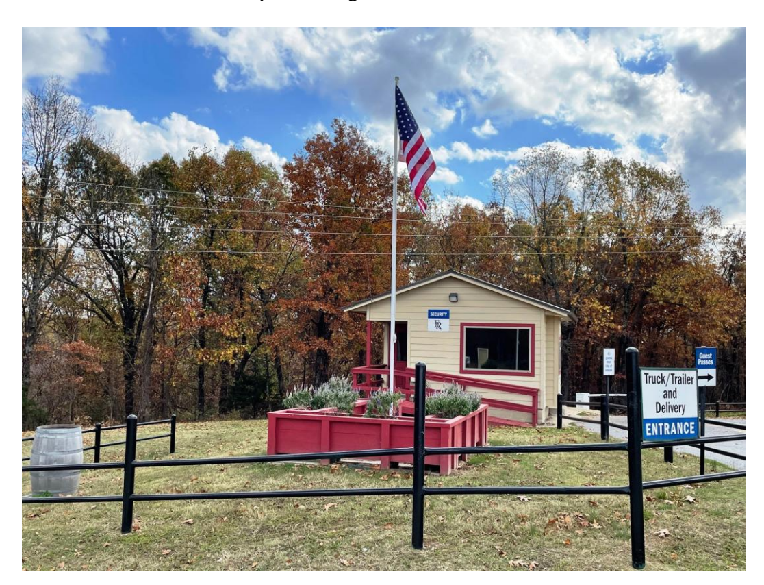
PLEASE REFER TO STANDING RULES FOR "SECURITY", PAGE 31-32