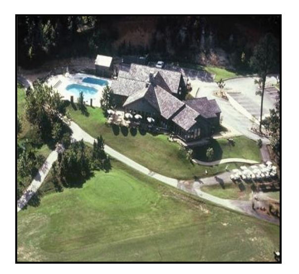
Overview of swimming pools