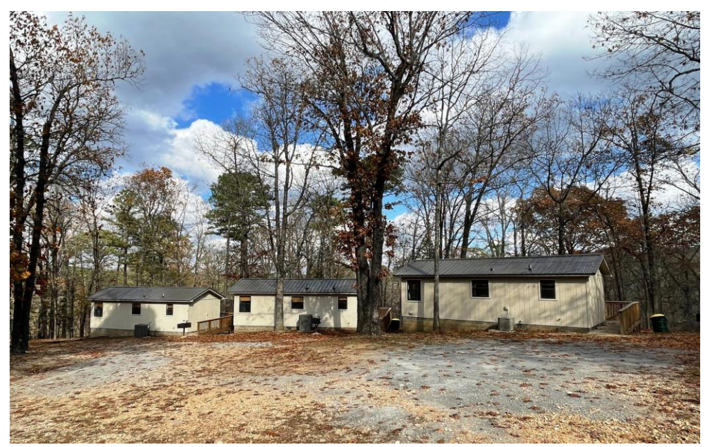
PLEASE REFER TO STANDING RULES REGARDING THE CABINS, PAGE 13, "FACILITY USAGE

More information: Visit the official Flint Ridge Resort website: www. FlintRidgeResort.com