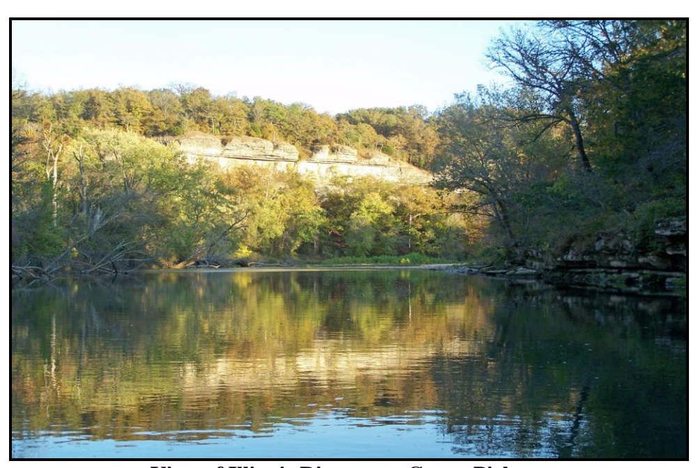
View of Illinois River near Canoe Pick-up

PLEASE REFER TO STANDING RULES FOR "CANOEING" AND RIVER SAFETY, \underline{ \text{PAGE 4-6} }