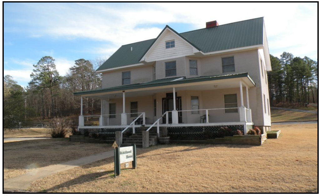
Statehood House at Recreation Complex

Reservations and a minimum of a two nights stay are required.